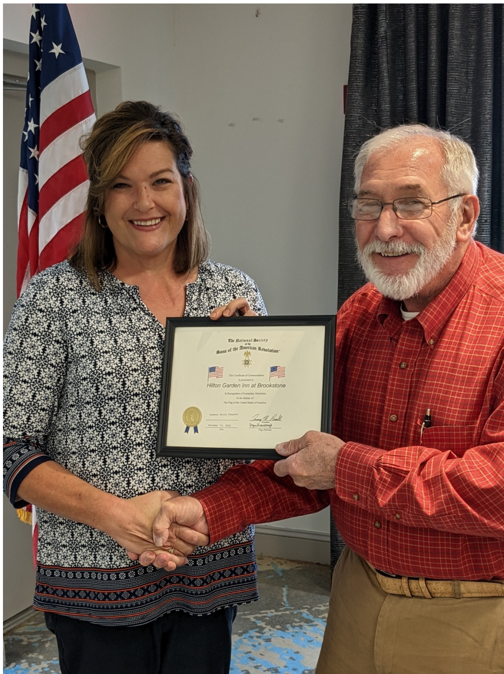
Hilton Garden Inn