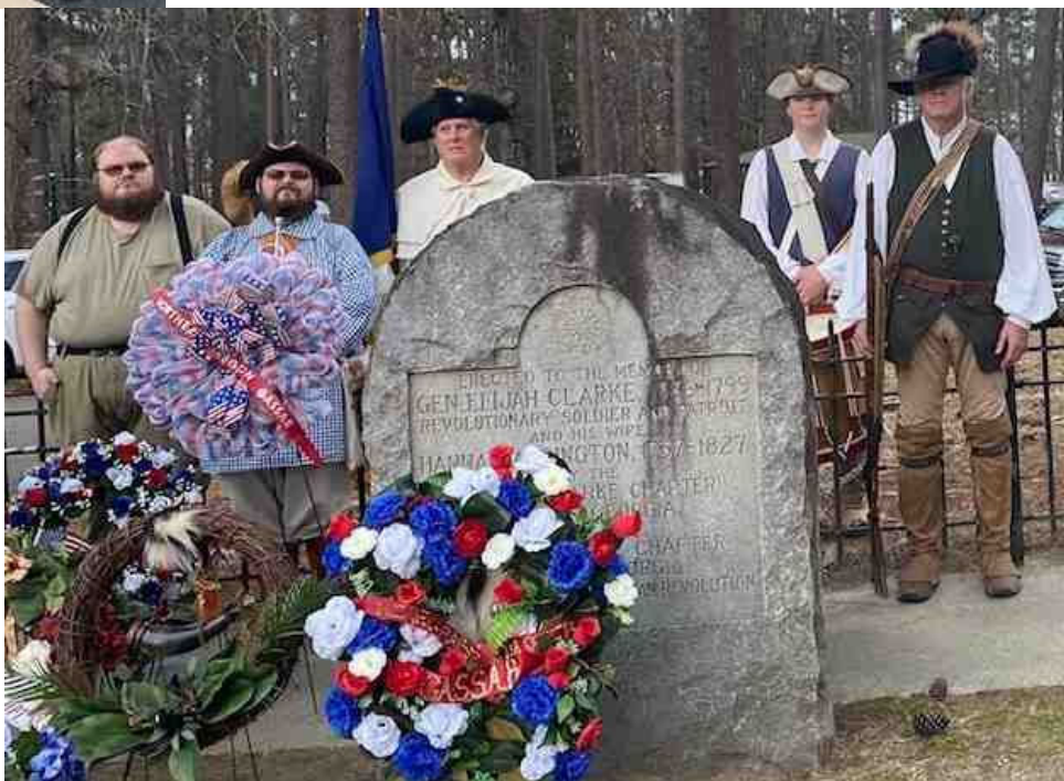
Marker at Elijah Clarke State Park