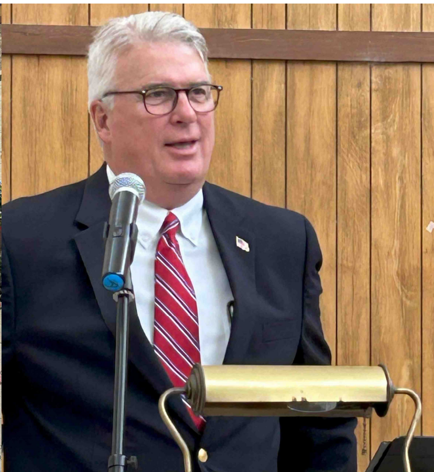
Skip Henderson Mayor of Columbus, GA