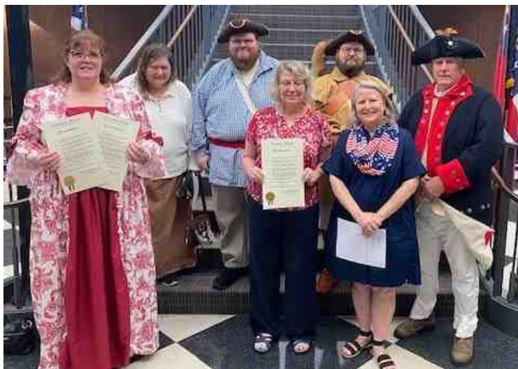
Members of Coweta Fall Chapter SAR, George Walton Chapter DAR, Oglethorpe Chapter DAR at the Columbus City Council meeting getting our Proclamation for the "Shot Heard Around the World" on April 22, 2025.