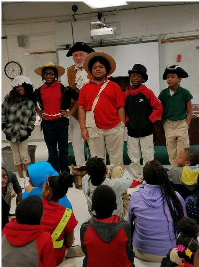
J.D. Davis Elementary