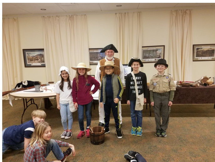
National Infantry Museum