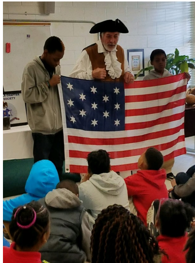
J.D. Davis Elementary