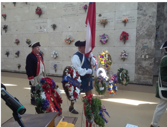
Tot and Left: Presentation and Retiring of the Colors, Coweta Falls Sons of the American Revolution Color Guard.