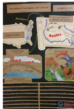
The winning poster